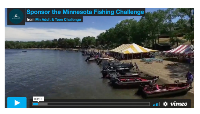
CORPORATE DONOR VIDEO: This video is a little longer and designed to appeal to companies, businesses and potential corporate donors. Hover over "Sponsors" on the top navigation and click "Sponsorship Opportunities" to find this video.

Raffle ticket sales count towards your $500 fundraising prize boat entry and other levels of your fundraising goal. Sell only 25 tickets and get a ticket in the drawing for the boat!